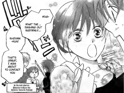
In the last chapter Shouma returned to his home town's festival